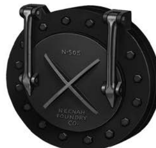
Type FF attached to flanged iron pipe.