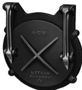
Type SF attached to concrete wall.