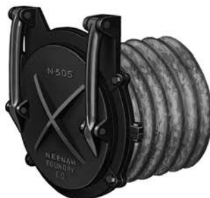
Type CF attached to corrugated metal pipe. (not for use with helical CMP)